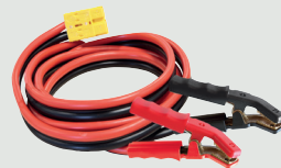
Clamps: 2 x 8 m - 16 mm 2 056572